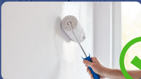
Faded or sun damaged paint