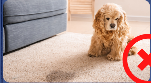
Stains, burns or bad smells