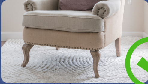
Furniture marks on carpet