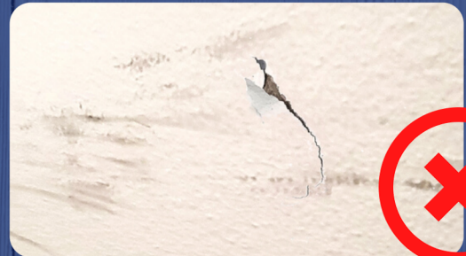
Heavy scuffing, gouges & dents