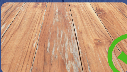
Floor wear in high traffic areas