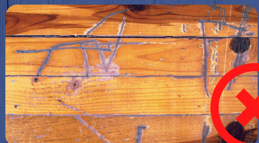
Scratches, stains or divots