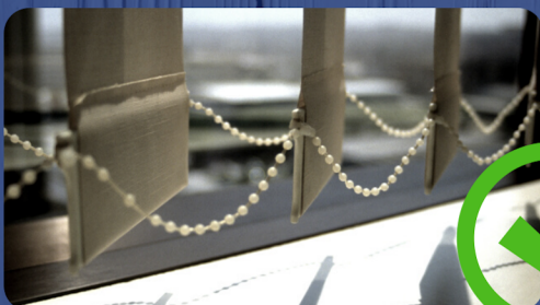
Sun damaged blinds